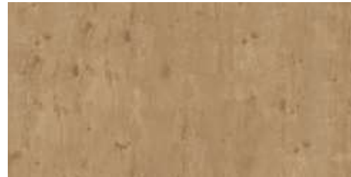
LVT Click flooring

The following figure shows an example of LVT Click flooring: